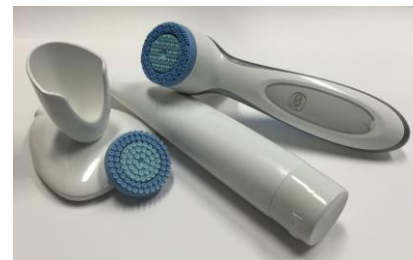
Photo 1. Soft-polymer, counter oscillating facial cleansing device.