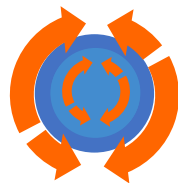
Figure 1. Representation of the counter oscillating motion of the soft-polymer surface.

The investigator noted immediate improvement following one cleansing in skin smoothness ( p=0.009 ), softness ( p=0.017 ), texture ( p=0.028 ), and cleansing ability ( p<0.001 ). Further sustained improvement occurred in all of these attributes, including pores, with all parameters being highly statistically significant ( p<0.001 ) after 7 days of use with continued excellent performance until the study conclusion at day 14. The sensitive skin subjects noted improvement in skin softness ( p=0.011 ) and smoothness ( p=0.008 ) immediately after one use of the treatment/cleansing device. After 7 days of use, the subjects rated improvement in smoothness ( p=0.002 ), softness ( p=0.002 ), pores ( p=0.041 ), texture ( p=0.002 ), and cleansing ability ( p=0.019 ). This improvement continued into day 14 post cleansing where highly statistically significant ( p<0.001 ) improvement was seen in smoothness, softness, pores, and texture with statistically significant improvement in cleansing ability ( p=0.002 ). All 16 subjects completed the study. No tolerability issues were noted by the investigator dermatologist or the sensitive skin subjects. Additional research is being conducted to evaluate this unique technology.